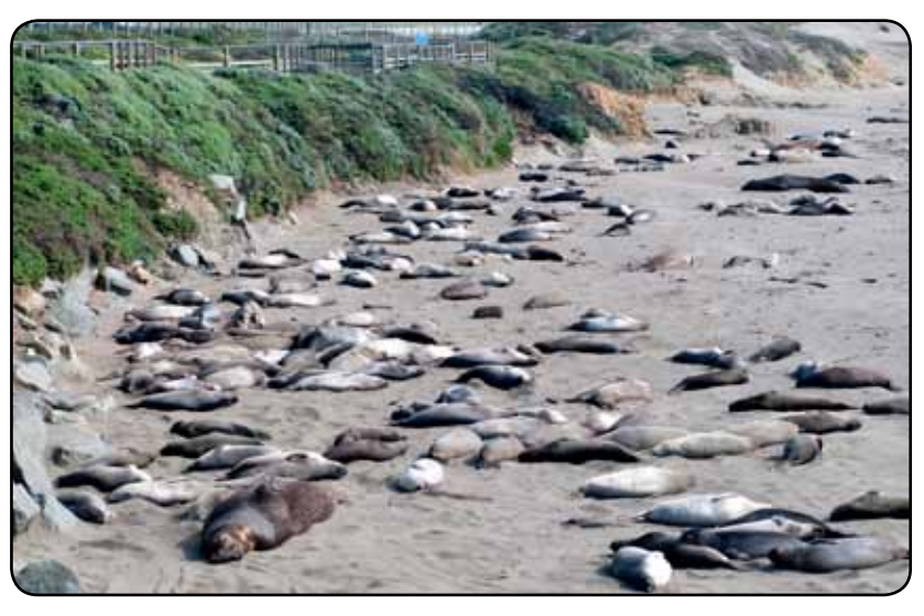
Elephant Seal Rookery with observation platform near San Simeon Photo: Stan Russell

Gray whales migrating along the Big Sur coastline Photo: Stan Russell