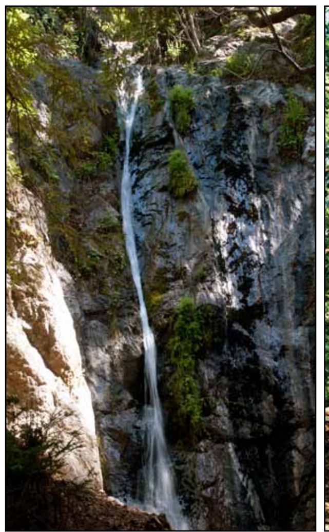
Pfeiffer Falls, Pfeiffer Big Sur State Park

While Big Sur's beaches hardly resemble the vast stretches of sun-baked sand that dot Southern California's easily-accessible coastline, they offer the visitor a wide variety of recreational possibilities.