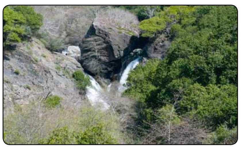
Salmon Creek Falls