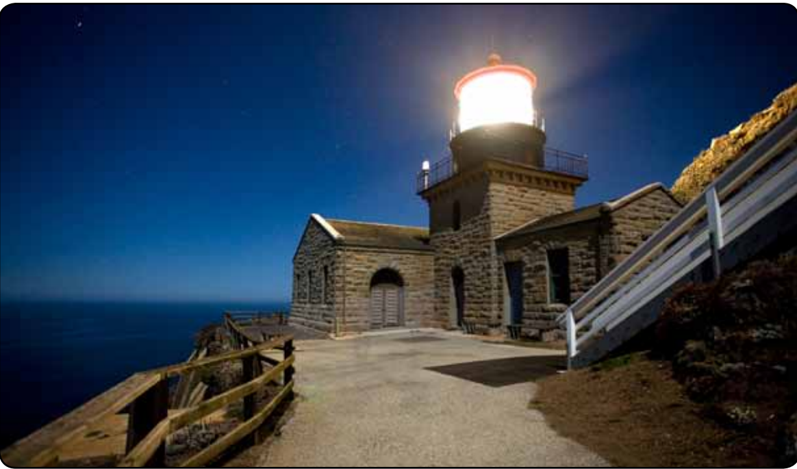
Point Sur Light Station

For information regarding guided tours, check the interpretive notices posted in the state parks. Trained volunteer docents provide an informative and pleasurable tour to the visiting public, and provide only access to the Point Sur Lightstation.