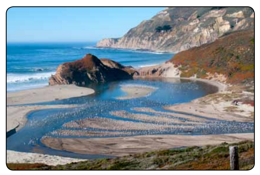
Little Sur Rivermouth