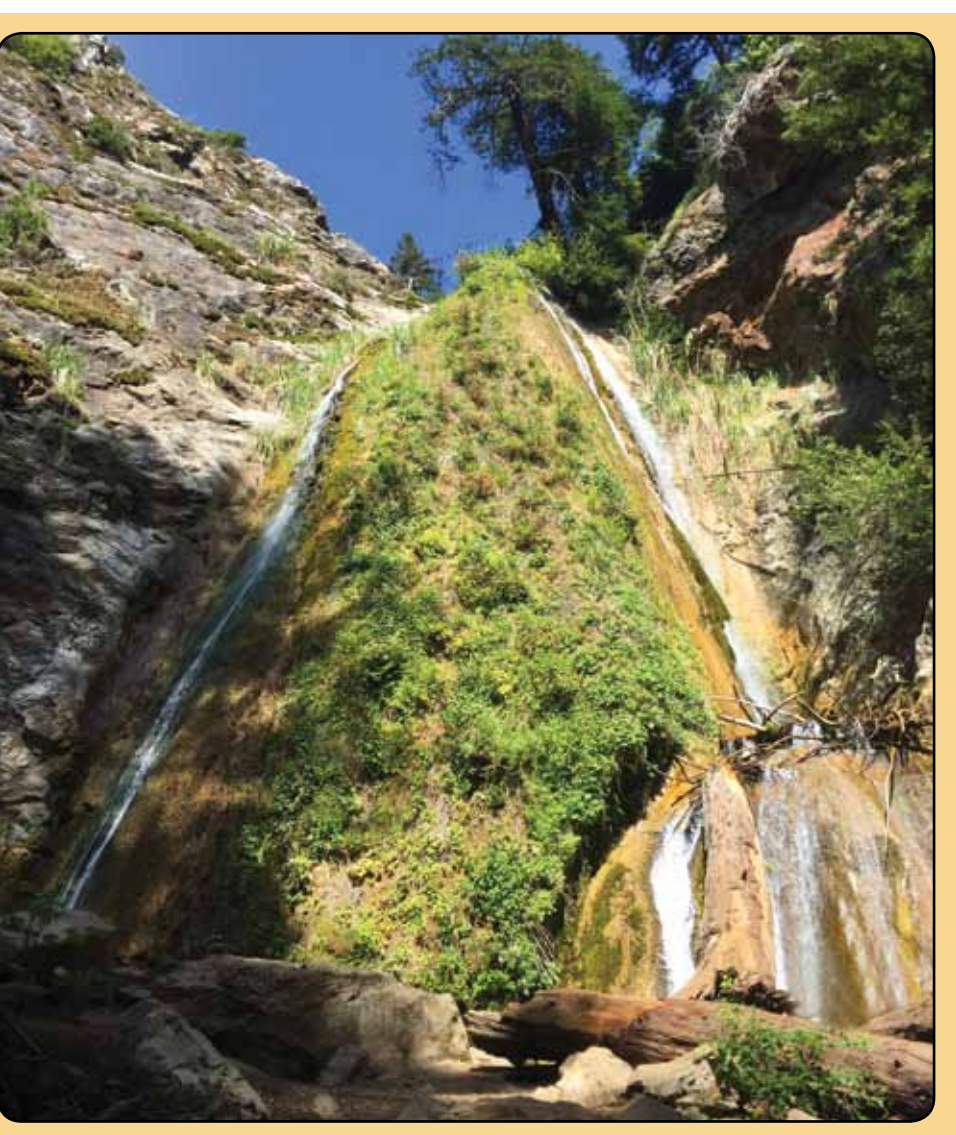
Limekiln Falls, Limekiln State Park