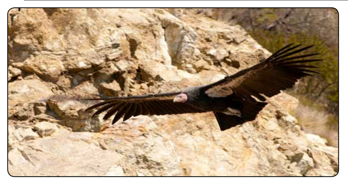
Rare California Condor soaring along cliffsides (9.5 ft wingspan)