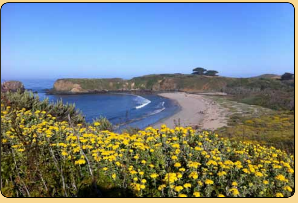
Andrew Molera State Park, Big Sur Rivermouth